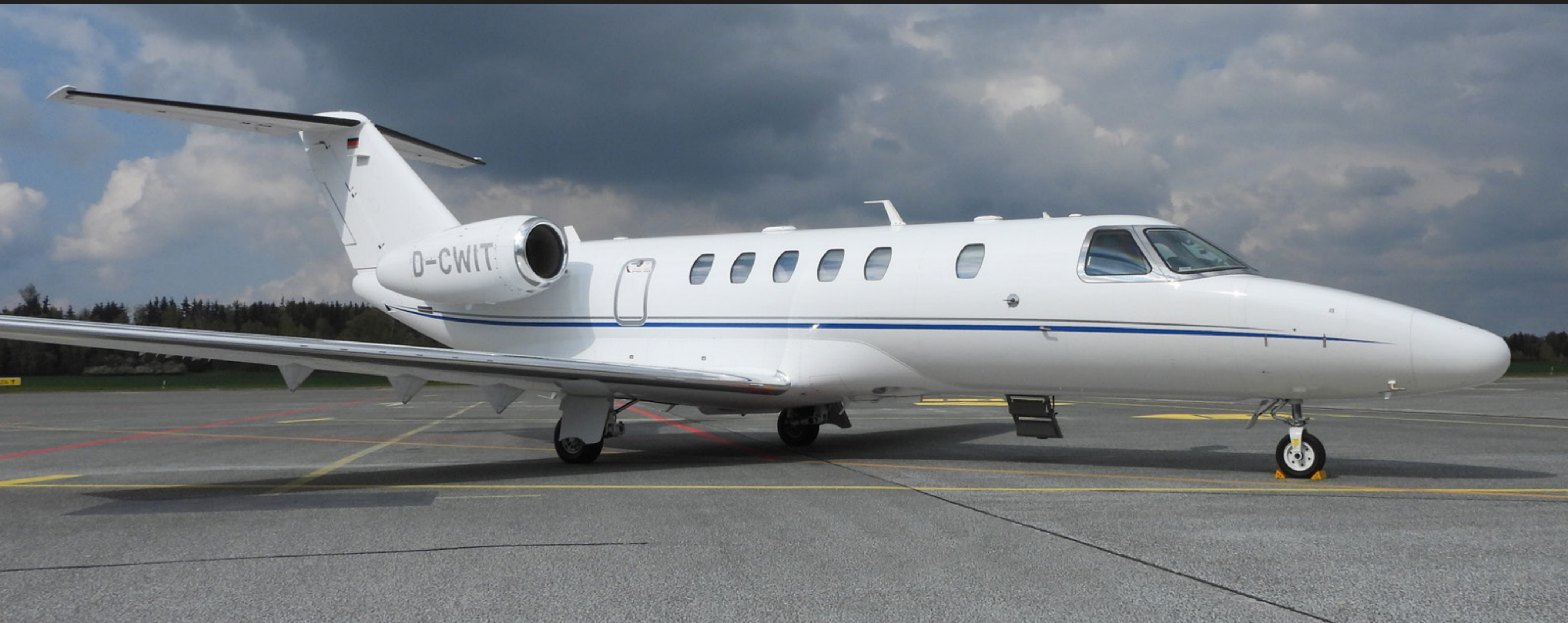
2013 Textron Cessna Citation Jet CJ4 SN: 525C-0124